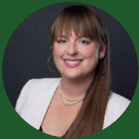
Brittny Anderson Minister of State for Local Governments and Rural Communities