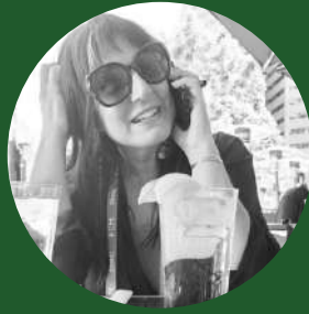
Michelle Staples, Mayor, City of Duncan

This workshop focused on the role of Community Action Teams (CATs), intersectoral coalitions mandated to develop and implement tailored, action-focused strategies to address the toxic drug crisis. These teams bring together diverse stakeholders, including grassroots community organizations, local municipalities, healthcare providers, law enforcement, and social services, to create comprehensive and localized solutions to the crisis.